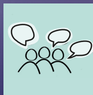
MENTAL HEALTH CONFERENCE