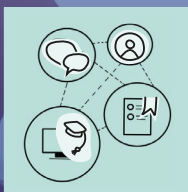
MOOC A MASSIVE OPEN ONLINE COURSE